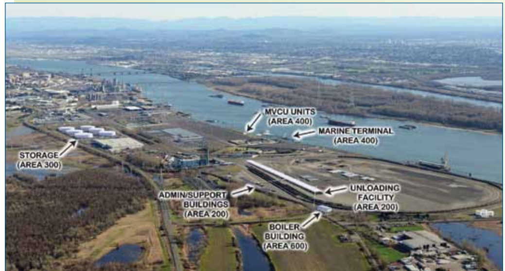
Aerial photo simulation of proposed terminal site from Vancouver Energy's application.

The EFSEC staff is currently preparing a final environmental impact statement on the project, which could be released to the public this summer or fall. Meanwhile,