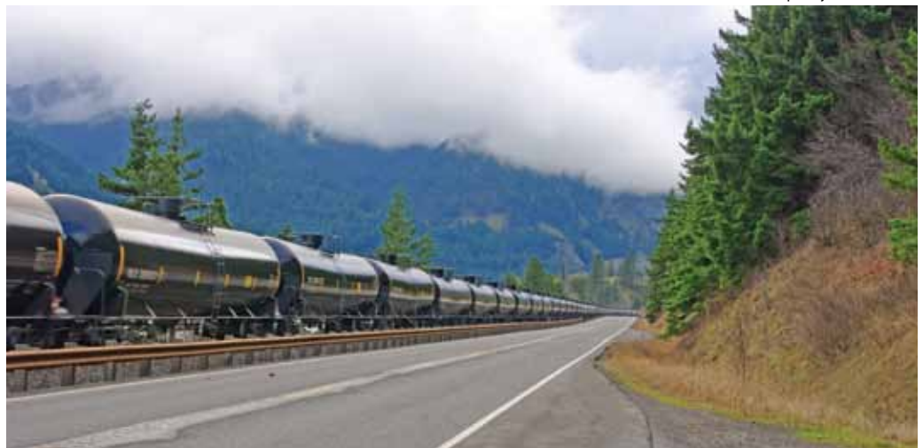
Mile-long oil trains are common sights along the river beside Washington Highway 14.