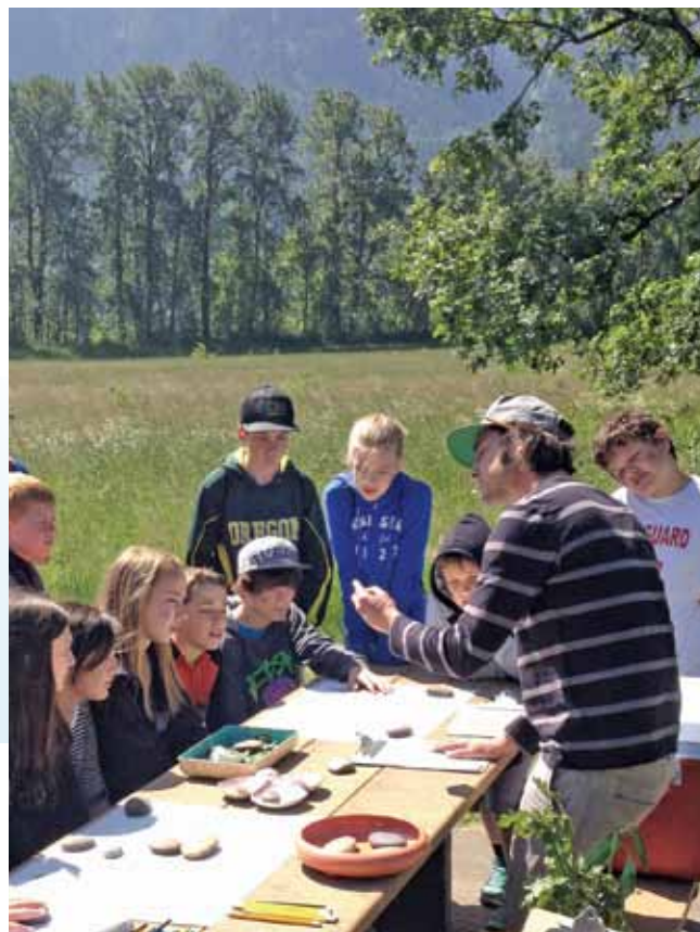
Sixth grade students experience firsthand learning outdoors with naturalists, artists, and educators in the Explore the Gorge youth program.

One possibility that especially excited Phyllis was Steigerwald Shores, the expanse of riverfront land adjacent to Steigerwald Lake National Wildlife Refuge. This beautiful wetlands area caught her attention for the rich variety of wildlife it supports, but she also knew that it could provide an inspiring outdoor laboratory for the youth